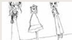
FUTURE STARTS TODAY BIANCA PAKUSEVSKIJ 00:00:30