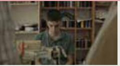
CIRCLE FERHAT ERTAN 00:09:38