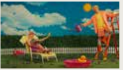
ARTIFICE KATE HARPOOTLIAN 00:06:26