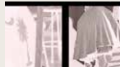
ALL THESE ARID PLACES - CHRONICLE ONE K. S. TEHARA 00:00:56