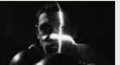
EROTICA (MADONNA'S CELEBRATION TOUR) RICARDO GOMES 00:05:00