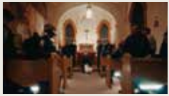
SAFE FROM HARM WILLY CHAVARRIA 00:13:49