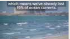
THE DAY AFTER TOMORROW SUZANNE VEURIOT 00:00:30