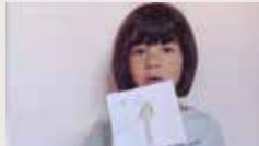
LOVING KINDNESS FOR EARTH SOA 00:00:31