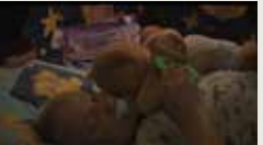
HAPPY HAPPY BABY JAN SOLDAT 00:20:00