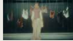
SHIMBALAIE MATTEO FRASCA 00:05:11