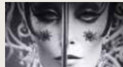
DARK NIGHT OF THE SOUL MARK MULLINS, MALCOLM DOHERTY 00:03:42