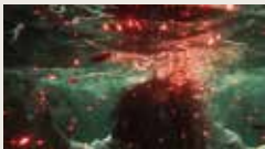
SILENCE JULIA KARSONOVA 00:02:00