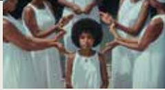
THE RIVER HERRANA ADDISU 00:17:33