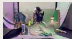
GREEN DEAL ROM DZIADKIEWICZ UKRAINATV 00:08:00