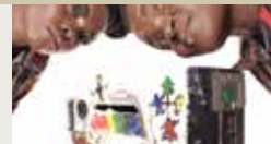
THE CULTS DANI PLOEGER 00:06:11

(UP)LOADED FROM THE CORPORAL TO THE VIRTUAL INTRO BY ALEX MURRAY LESLIE