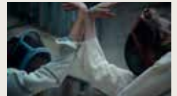
DECHAMPS "EN GARDE" SS25 COLLECTION FILM LUCAS BECCARO 00:03:48