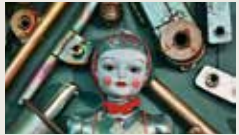
LOVE BYTES: AI-MEE IS HEARTLESS MELODY LEMOON BOSSAN, ETHEREAL GWIRL 00:03:00