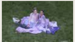
THE GRIP OF FEAR ALENA PLOSKI, GUILLAUME JOLLY 00:04:38