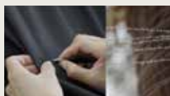
ERDOS X RUOHAN AW 2023 ERDOS 00:00:43