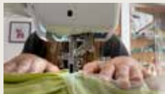
RAE-CYCLING RAE GROTH 00:00:34