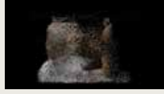
ASTERISK'S ODYSSEY YILIN DU, KE PENG 00:02:00