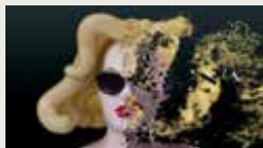
THE CASTLE PANDEMONIA 00:05:20