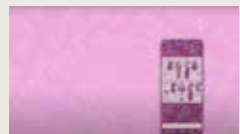
WHY BUY? IS SOCIAL MEDIA MAKING US SHOP MORE? CODY O'CONNOR 00:13:07