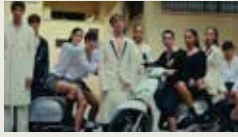
CASERTA ROYAL MICHEL HADDI 00:02:57