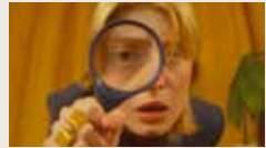
GUIDE TO SELF-ESTEEM TATIANA PELLICANÒ 00:01:54