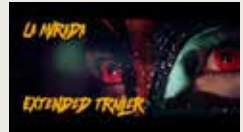
LA MIRADA TRAILER MATT WILLIS-JONES 00:03:30