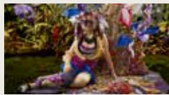
THE DREAM-QUEST OF UTOTH NINGXIN ZHANG, RUNQING YU 00:04:25