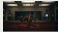
UNDER THE SKIN OF A GUILD: WAKE OF LOST SOULS FREDDIE LEYDEN 00:04:10