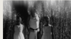
PARADISE CHILD 00:04:11