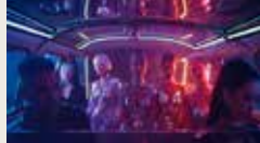
RAGE MONEY POWER DAVID KYUNG-MIN SHELDRICK 00:01:17