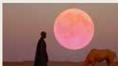
STILLNESS NORA HASE 00:01:30