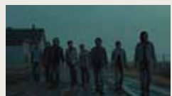
POINT ZERO STEVEN MILLS 00:03:03