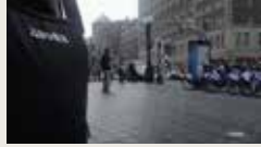
CAPTURE THE BAG WARREN COLE ACKERMAN 00:01:24