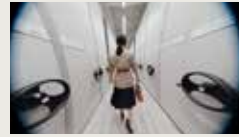
PRADA SS25 JIA LING JOHN MURD 00:00:40