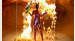
RUNWAY.EXE PETRA 00:02:16