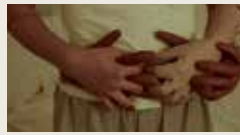
STRINGS OF ATTACHMENT GIEUN CHAE 00:02:08