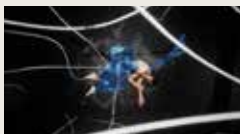
UNSHELLED CHUNQI ZHAO 00:04:20