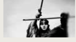
ÜBERMENSCH (OVERMAN) TIM YIP 00:03:11