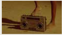
RED CASSETTE VICTOR BASTIDAS 00:14:42