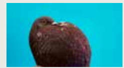
WHEN DOVES TRY THALIA DE JONG 00:02:32