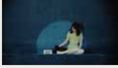
EMILIA AND THE CAT SIMONE STEFANO, POZZI YANG 00:02:00