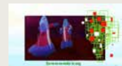
BLOMSTRA I TROLLHÄTTAN JENNIFER-ANNELIE SÄLSSI 00:04:12