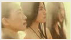
WORLD TREE XUNZI WANG 00:30:19